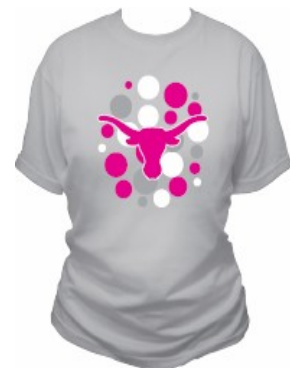
Short sleeve Sweatshirt