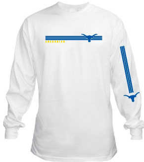
Long sleeve Sweatshirt