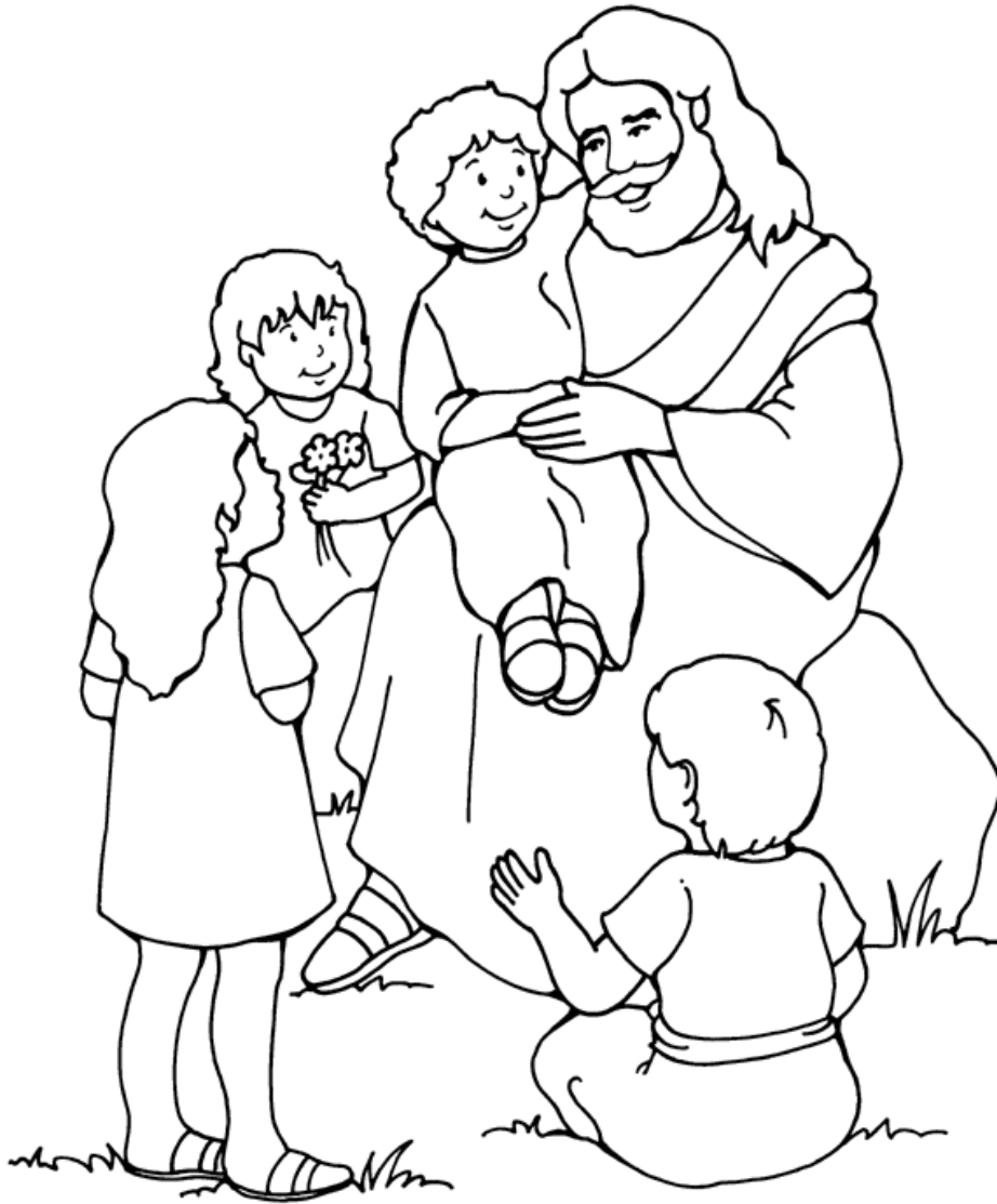
Jesus and the Children

From Thru-the-Bible Coloring Pages for Ages 4-8. © 1986, 1988 Standard Publishing. Used by permission. Reproducible Coloring Books may be purchased from Standard Publishing, www.standardpub.com , 1-800-543-1301.